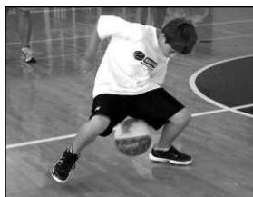
Talent Show Winner