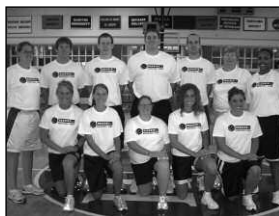
Girls Camp Staff

Counselors - Our counselors provide outstanding supervision and guidance to the campers. Hanover counselors live in the dormitory, are dedicated to their work, and try to provide individual attention to all campers.