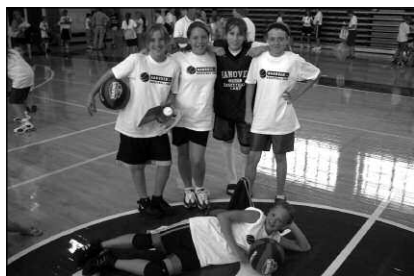
Hanging Out at the Hanover Camp