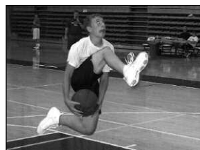
Fancy Lay-Up Contest