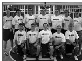
Boys Camp Staff